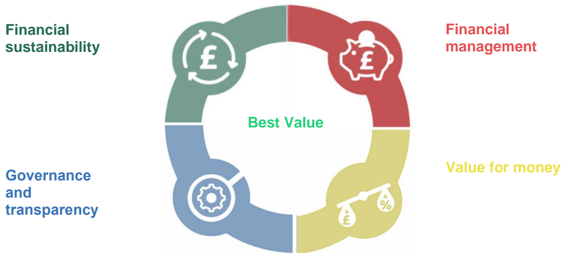
Exhibit 1: Audit dimensions within the Code of Audit Practice